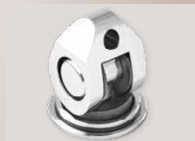
SMALL QUICK-LOCK SYSTEM