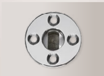
HIGH-POLISHED STAINLESS STEEL DECK FITTING