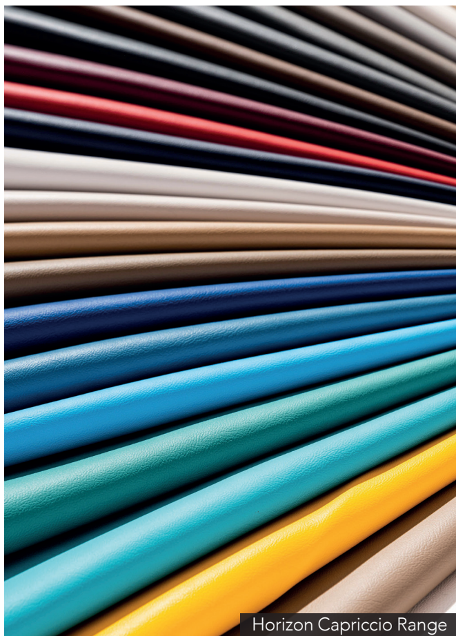
Horizon Capriccio Range