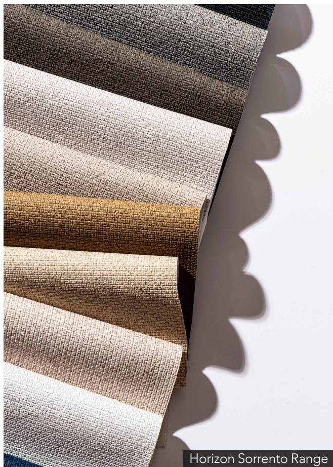
Horizon Sorrento Range