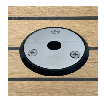
Low Profile Padeye