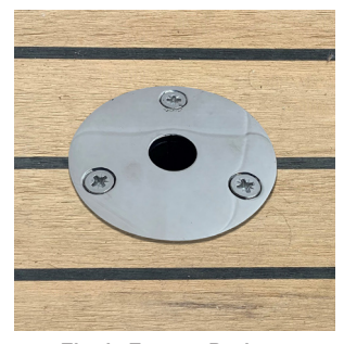
Flush Fitting Padeye