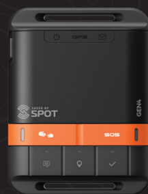
SPOT GEN4™ SATELLITE GPS MESSENGER