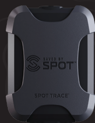
SPOT TRACE™ SATELLITE TRACKING DEVICE