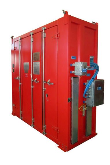
Modular accumulator unit fire fighting skid