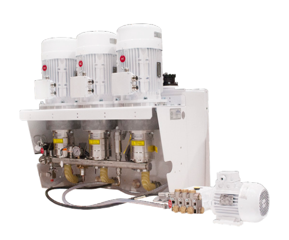
Micro pump unit with pilot pump

When installed in commercial or industrial properties, the Ultra Fog water mist fire protection system provides an efficient, secure and compact safeguard. Installation of the system in a heritage building is indispensable because it reduces the damage in case of a fire. The small amount of water used saves all the precious masterpieces from fire, and more significant, from water. In addition, because of low water consumption and, therefore, lightweight, the system can be easily placed in various vehicle types such as buses, trucks or heavy equipment transport. The Ultra Fog system is connected to an early warning detection alarm which allows prompt response to a fire condition. Together, early detection, fast reaction, and low water consumption save valuable property, sensitive equipment, precious works of art, and protects building occupants.