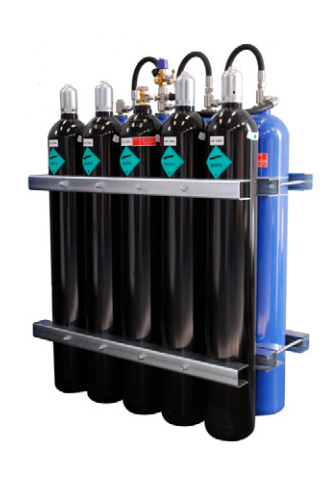
Modular accumulator unit