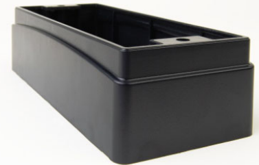
Surface Mounting frame is enclosed in package