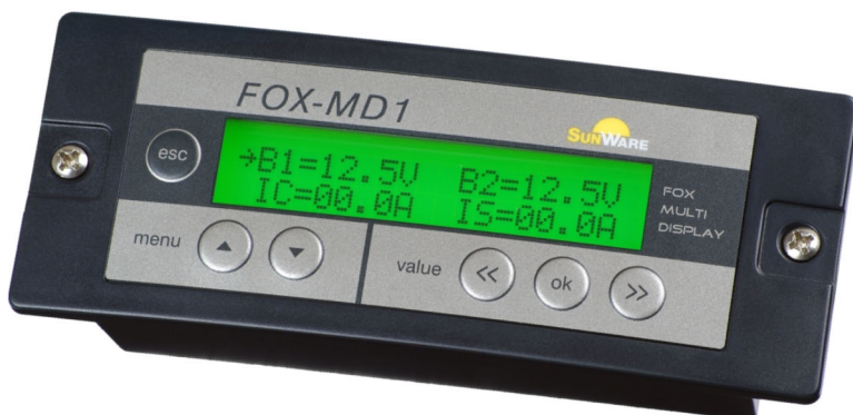
Remote display FOX-MD1