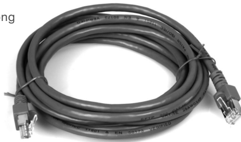
Connection cable 5 meter long