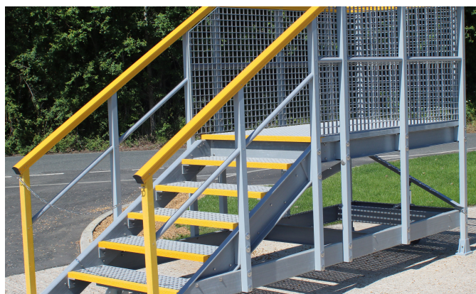
Mobile and Fixed Steps