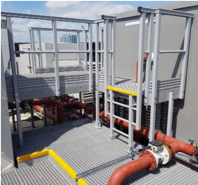
Ladders and Platforms