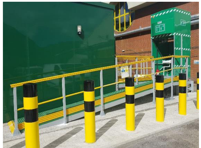
Static Ramp and Platform