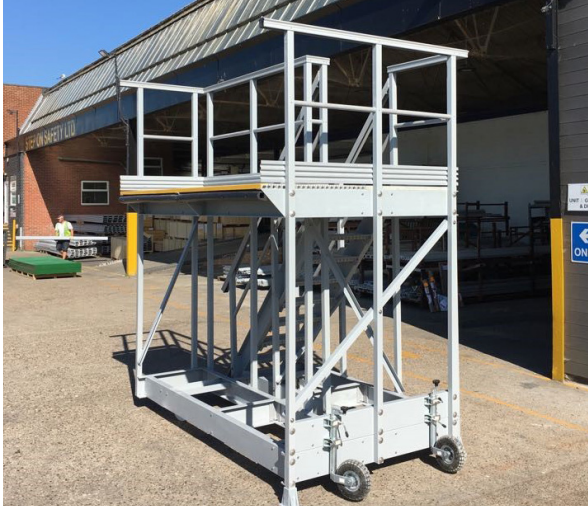
Mobile Stairs and Platform

Advanced engineered GRP Mobile and Static Structures, Stairs, Ramps and Platforms are fast becoming the cost effective solution for light and heavy duty environments that require permanent or temporary solutions. A range of highly engineered static and mobile solutions are available to suit a variety of commercial, industrial, marine, rail and waste management applications.