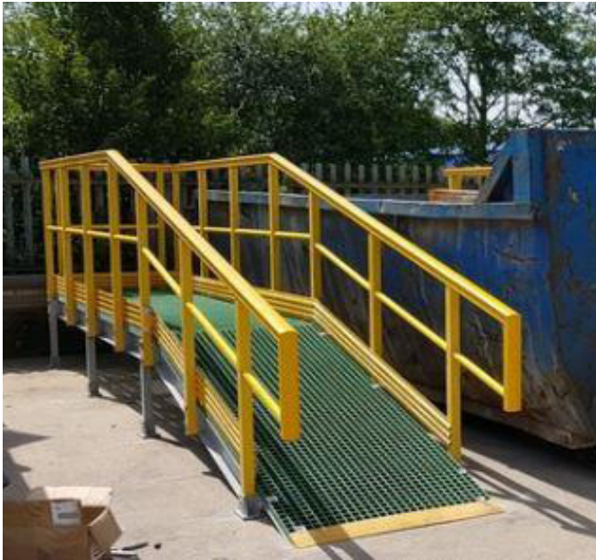
Ramp and Platform