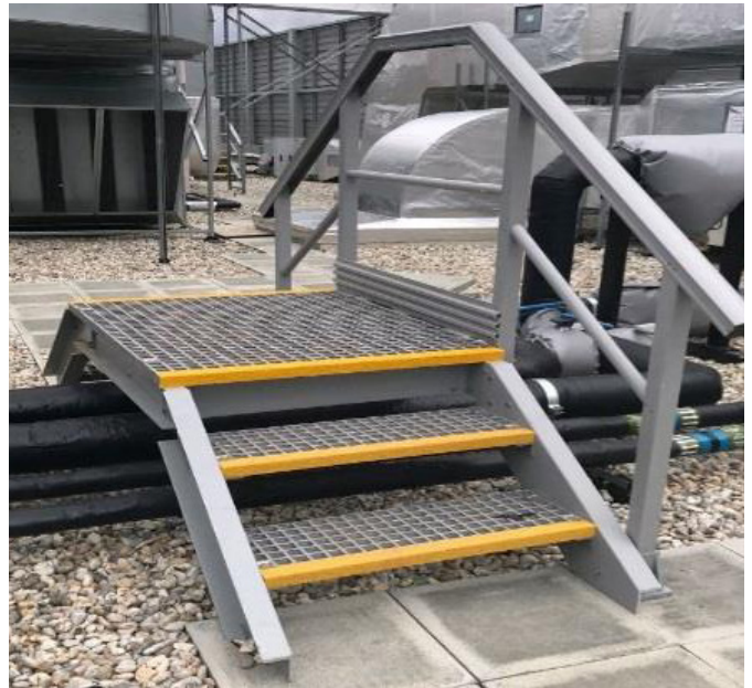
Up an Over