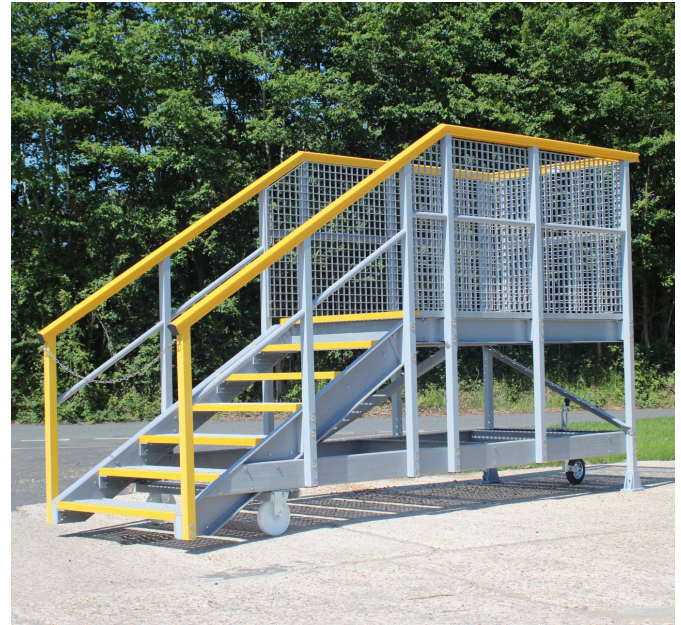
Mobile Steps and Platform