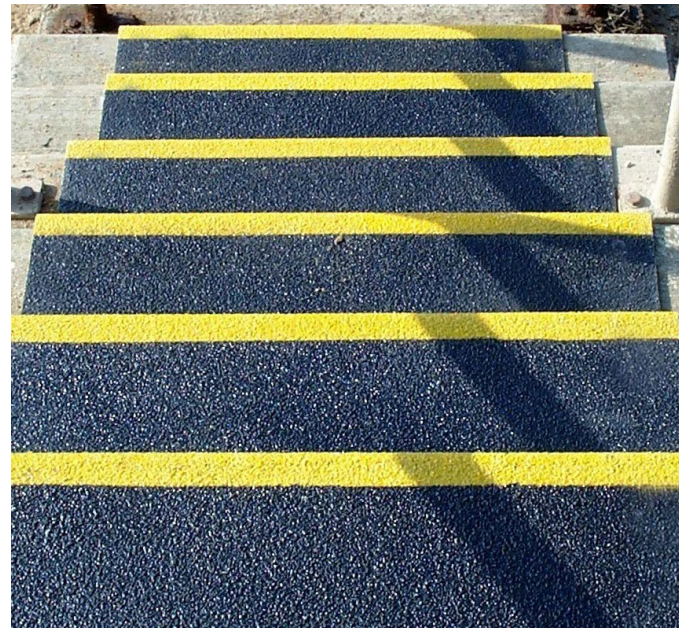
Stair Tread Covers & Nosing