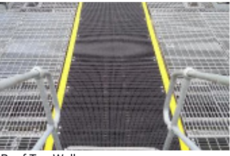
Roof Top Walkways