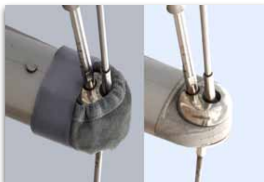
Good fitting with Velcro

Material: Leather, neoprene, Velcro Size: See table Colour: Grey Art nr: 1050, 1052, 1054