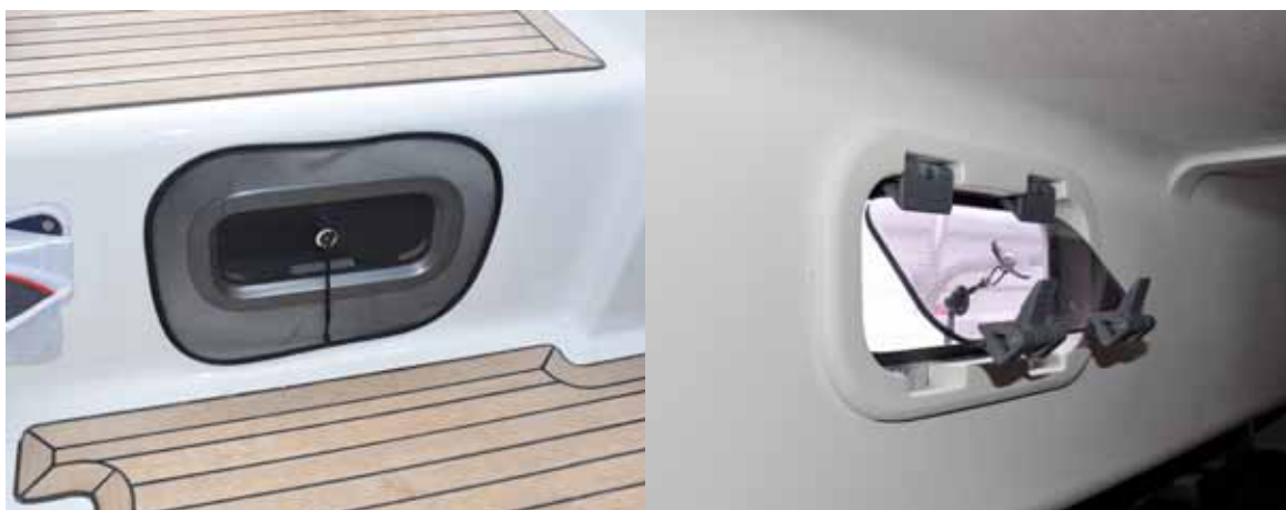
Mosquito net on portlight