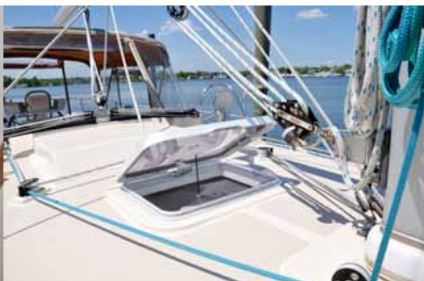
Open hatch give good ventilation