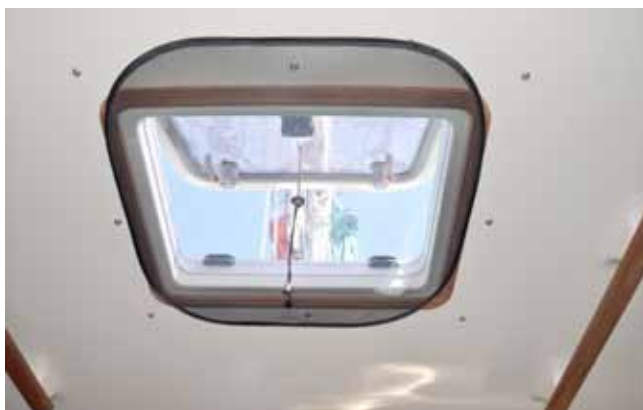
Mosquito net mounted from the inside