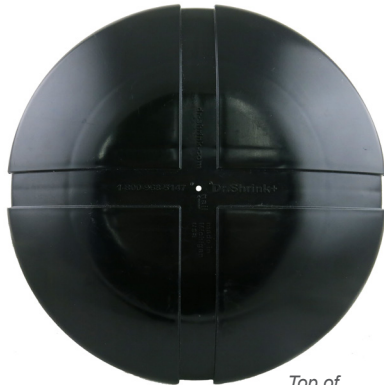
Top of Rhino Cap