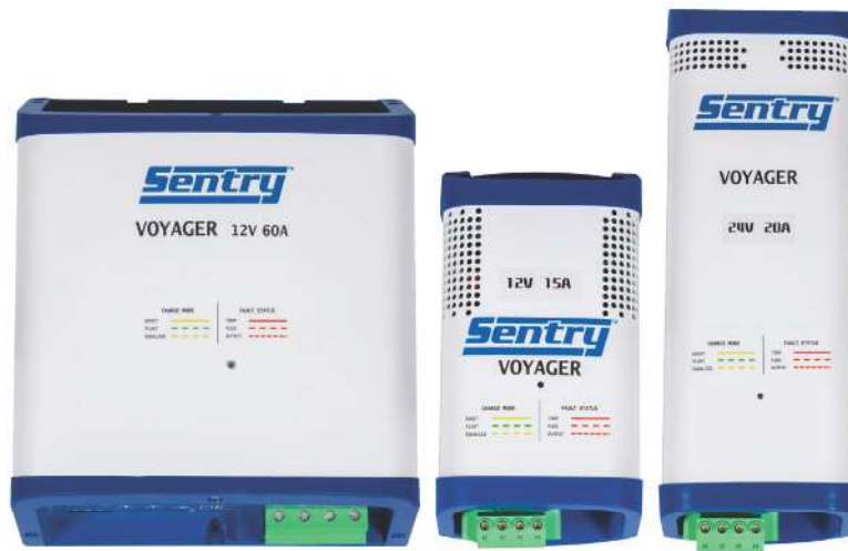
SV1260/3XJ, SV1215/3CJ and SV2420/3XJ Models Shown