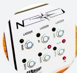
CONTROL PANEL with lighted pushbuttons stainless steel