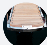
ROLLERS+LATITUDE allow resting on the dock latitude 1m up