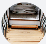
EXTRA STEP for the deck hydraulically operated