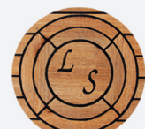
CUSTOM DETAILS yacht name initials on the teak surface