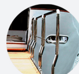
RAILINGS allow the full width use special designed