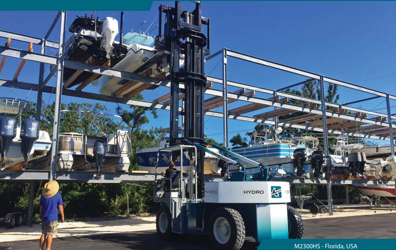
M2300HS - Florida, USA

Marinas and boat yards are proving grounds for efficiency and durability.