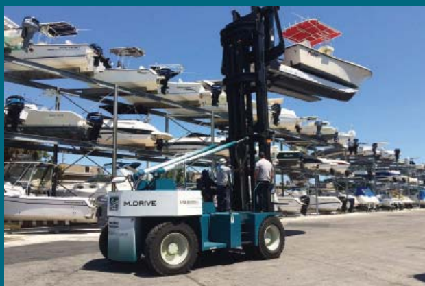
M2600H - Florida, USA