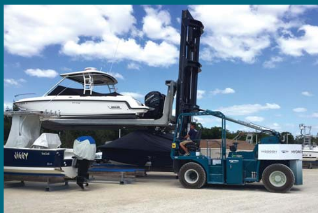
M2000H - Florida, USA

* Greater lifting heights will result in lower lifting capacities. See the load charts on model specification sheets.