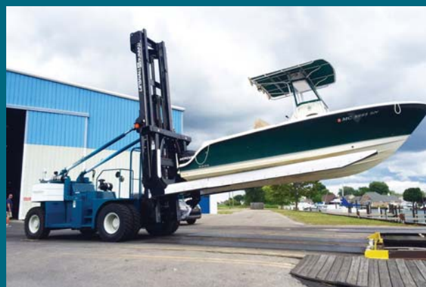
M2300H - Michigan, USA