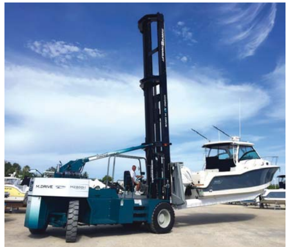
M2800H - Sarasota, Florida