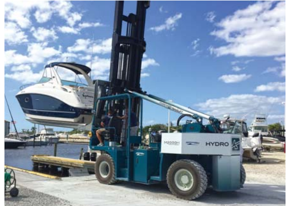
M2000H - Fort Myers, Florida

Visit marinetravelift.com to see product videos of our forklifts in action, as well as a current list of available features and options.