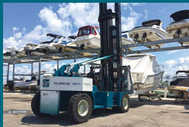
M2800H - Florida, USA