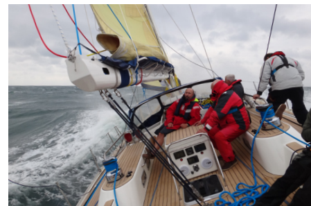
Flexiteek provides amazing grip in the toughest conditions.