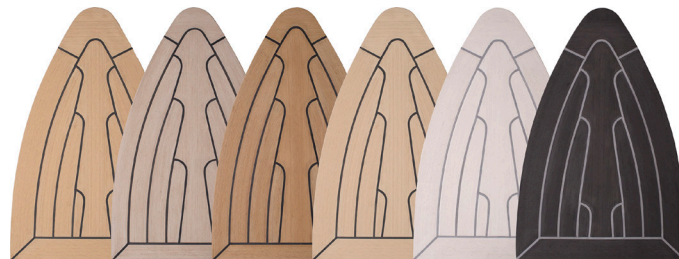
Flexiteek colors: Scrubbed, Weathered, Teak, Bleached, Off-White, Carbon