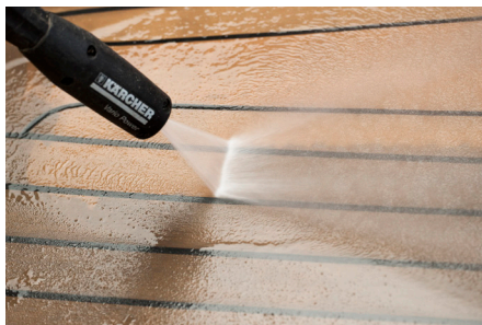
Clean with a high pressure washer.