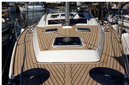
Beneteau 40 with Flexiteek Scrubbed.

For a full overview of the Flexiteek colors and caulk line color combinations, please visit: flexiteek.com/products