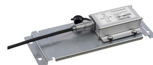
Sensor Unit with mounting plate