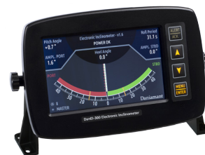
Bracket mounting model