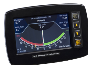
Panel mounting model