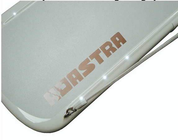
Pad Eyes for attaching the guys