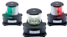
TYPE: DHR60 LED

Two LED-modules Main & Spare 10+ years lifetime