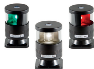
TYPE: DHR40 LED