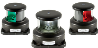
TYPE: DHR80 LED

Two LED-modules Main & Spare 10+ years lifetime