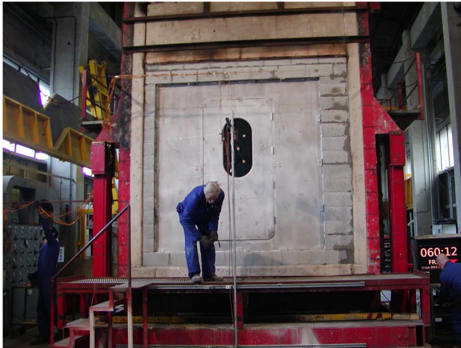
Exterior door immediately after 60 minute test up to 925 degrees Celcius