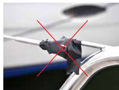
No more tape on the lifeline!