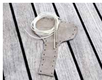
2 needles included in every package