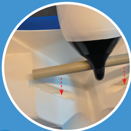
Push the rod/520 into the recess.