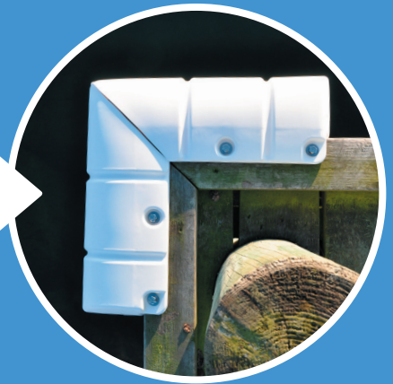
Converted into corner-fender.