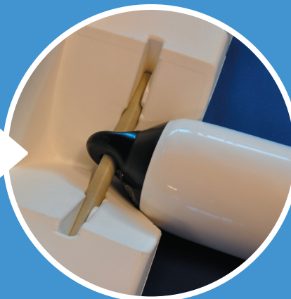
Result after correct mounted rod/520. The lower end/eye of the 520 should be secured to the dock also!