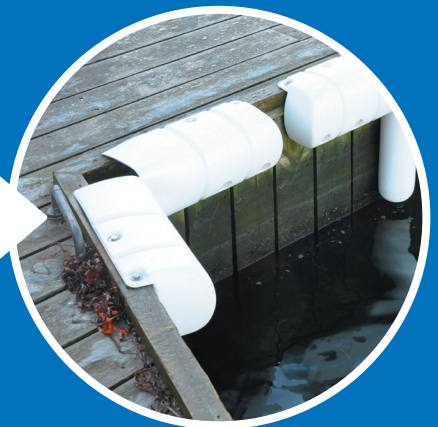
Converted into open corner-fender.