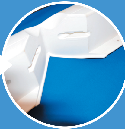
Result after cutting.