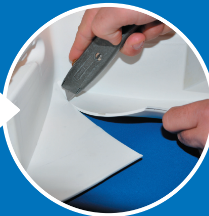
Result after cutting.