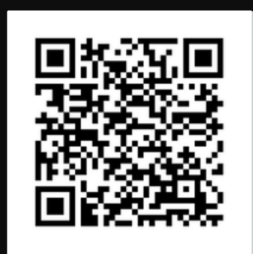
GET THE FULL PRESENTATION HERE