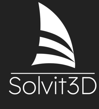
3D PRINTED BOAT PARTS