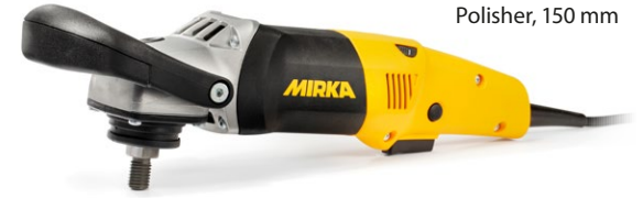
Mirka® PS1437 Polisher, 150 mm