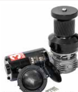
HDC-1000 HEAVY DUTY CAPSTAN