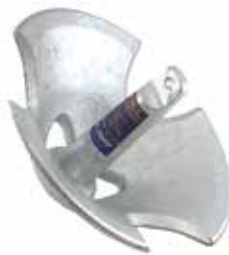
REC 25 GAL