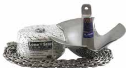
GX1-P PLATINUM 6-15

Combo Kits Include the GX1-P Winch Kit plus anchor swivel, rope, and REC anchor & chain in your choice of galvanized or stainless steel.