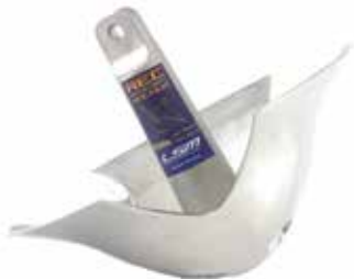
REC 15 SS

REC anchors are available in 15, 25, and 40lb in both hot dipped galvanized or stainless steel finish.