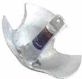
REC 15 GAL