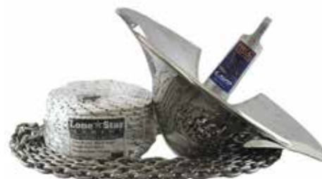
GX1-P PLATINUM 6-40