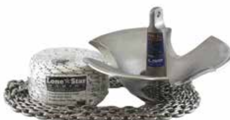
GX1-P PLATINUM 6-25