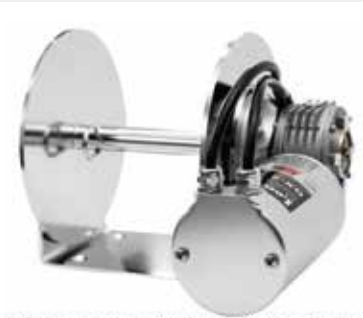
GX SERIES ANCHOR WINCHES

Our commitment to quality has certainly paid off, check out the Drum Winch Shootout on YouTube to see why LSM are at the Apex of drum Anchor Winch Performance & Reliability.