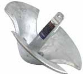
REC 40 GAL