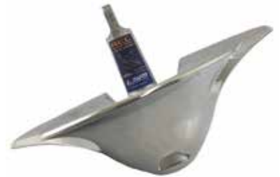
REC 40 SS