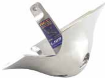
REC 25 SS