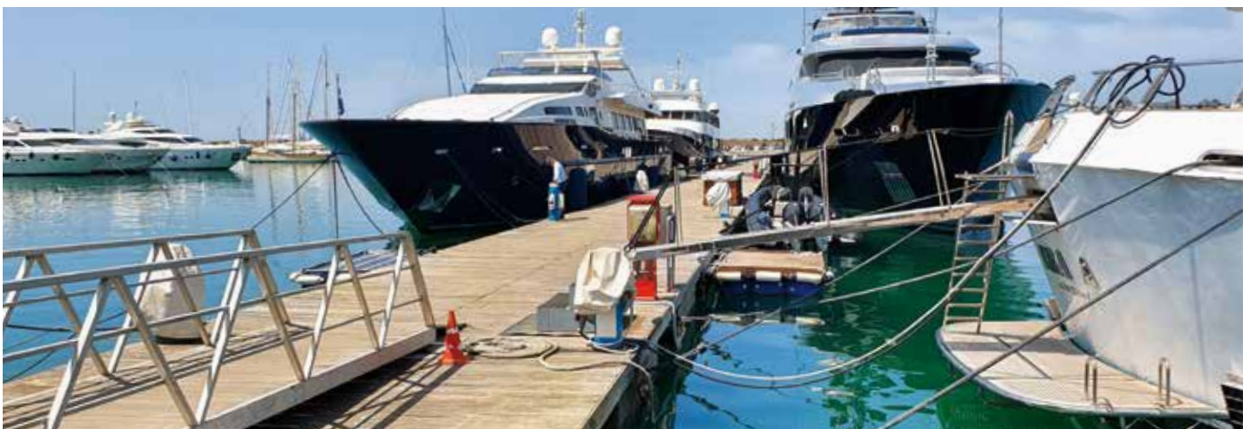
Floating pier FE/CA, Agios Kosmas, Athens - Greece