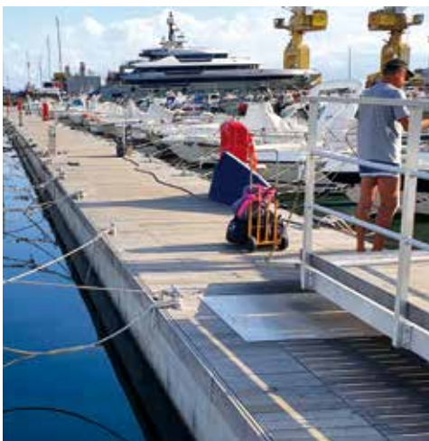
CA/LE type pontoon