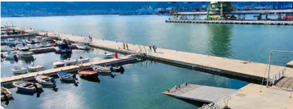
Floating breakwater FICA 20x8m, Marina Molo Pagliari, La Spezia - Italy