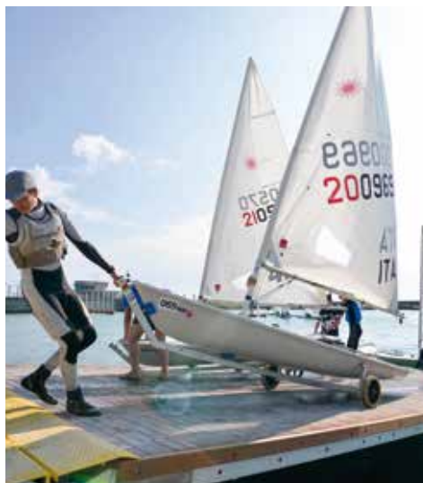
Laser Cup, Venice - Italy