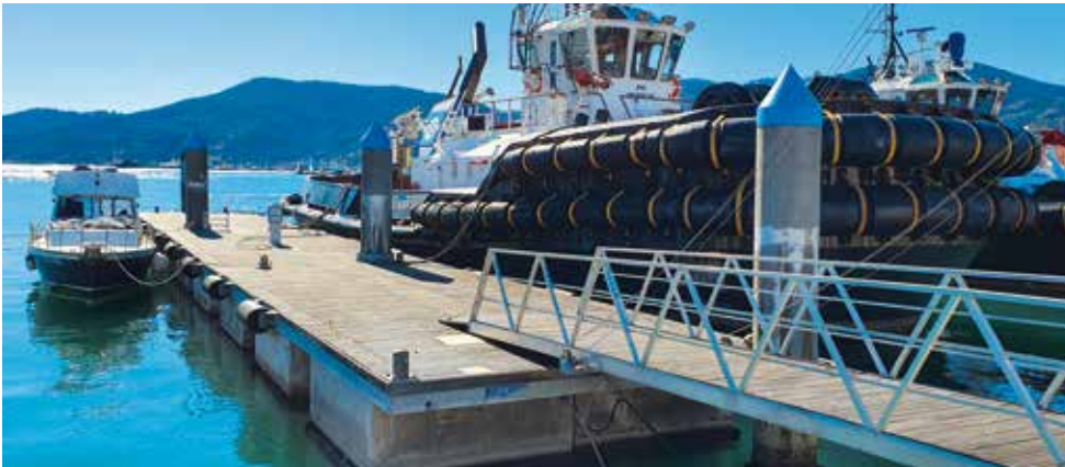
Floating piers for tug boats, Port Authority, La Spezia - Italy

There are several sectors in which Ingemar was able to provide a viable floating alternative to traditional fixed structures with innovative solutions, all tailor-made and designed for specific needs.