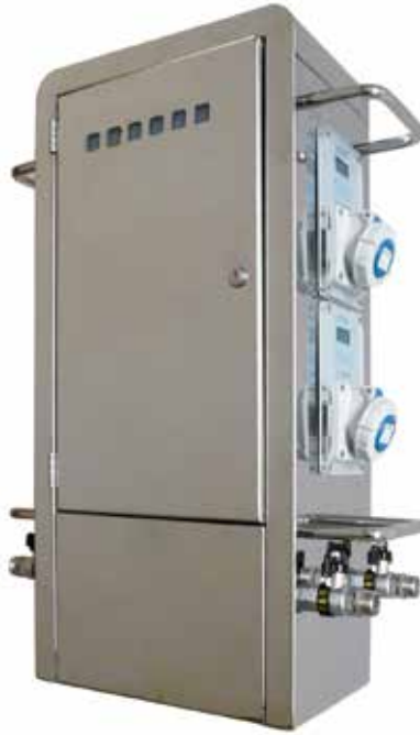
EROMAR 3 type service bollard

Other accessories for safety and functionality of the floating systems include safety ladders, emergency supports with a life buoy, solar LED lights, access lights and step marker lights.