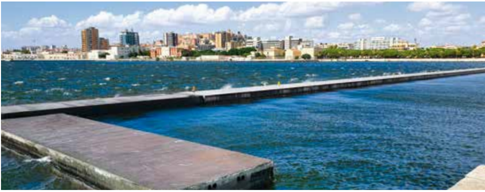
Floating breakwater FICA 12x3m, Autorità di Sistema Portuale del Mar di Sardegna, Cagliari - Italy