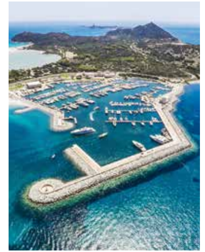
Marina di Villasimius, Cagliari - Italy