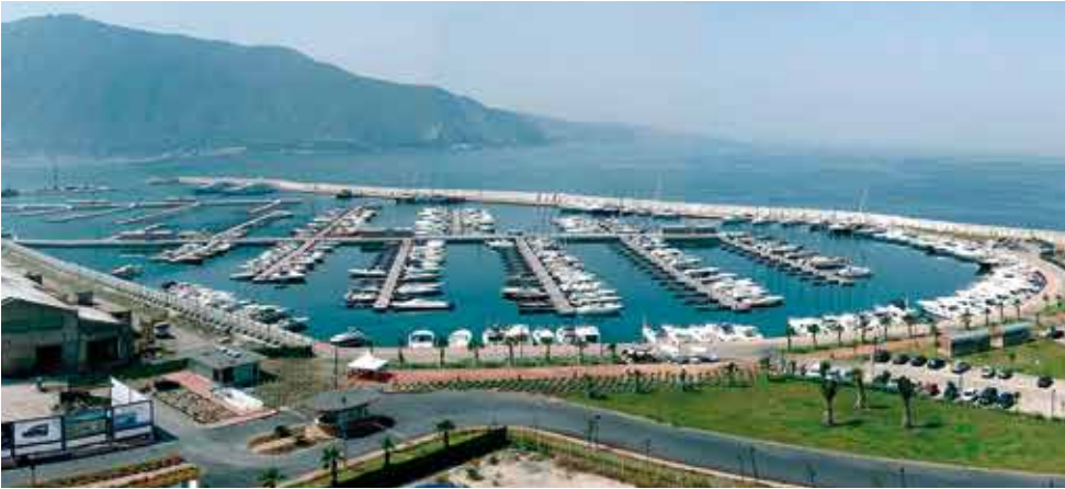
Marina di Castellammare di Stabia, Napoli - Italy