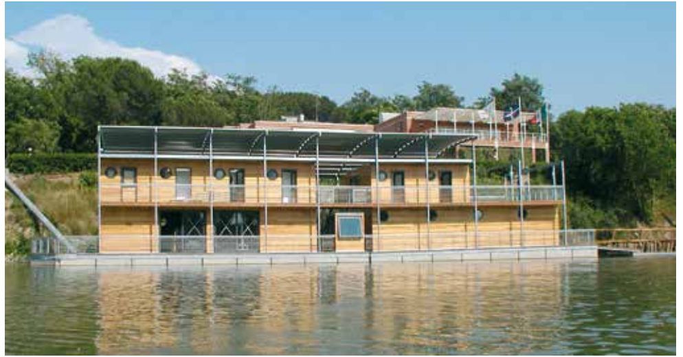
Floating rowing centre, River Tiber, Rome - Italy