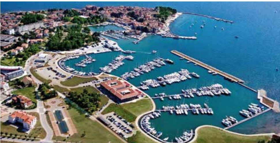
Marina Novigrad - Croatia