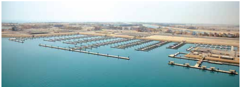
Sea City Marina - Kuwait