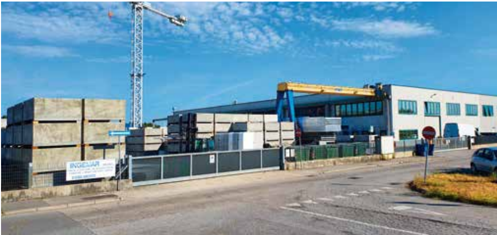
View of the plant storage area