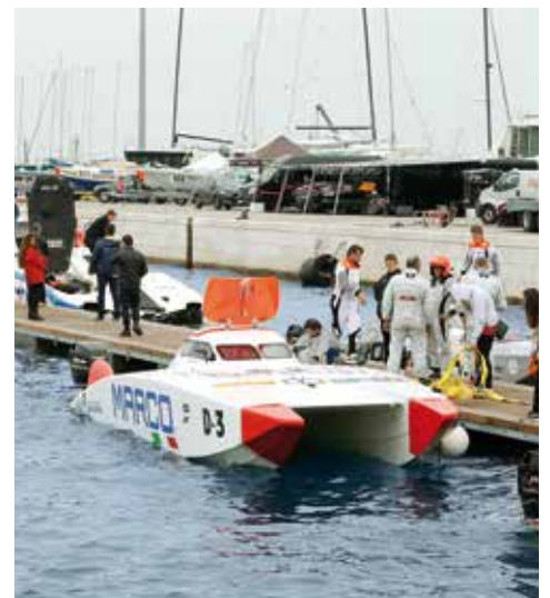
Offshore World Championship, Chioggia - Italy