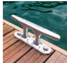
Aluminium cleat 3t