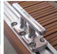
Aluminium cleat 5t