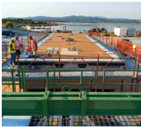
Mobile site for construction of breakwater elements 20x6m, Olbia - Italy

Experience gained suggests that floating wave attenuators are suitable for installations in areas subject to short waves, such as lakes, harbours and already partially sheltered areas, where it is advantageous to create relatively inexpensive barriers that are not based on the seabed and are independent from tide.