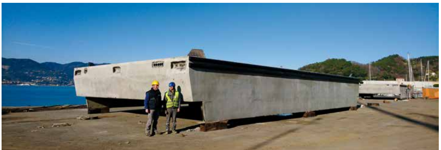
Wave attenuator element 20x10m