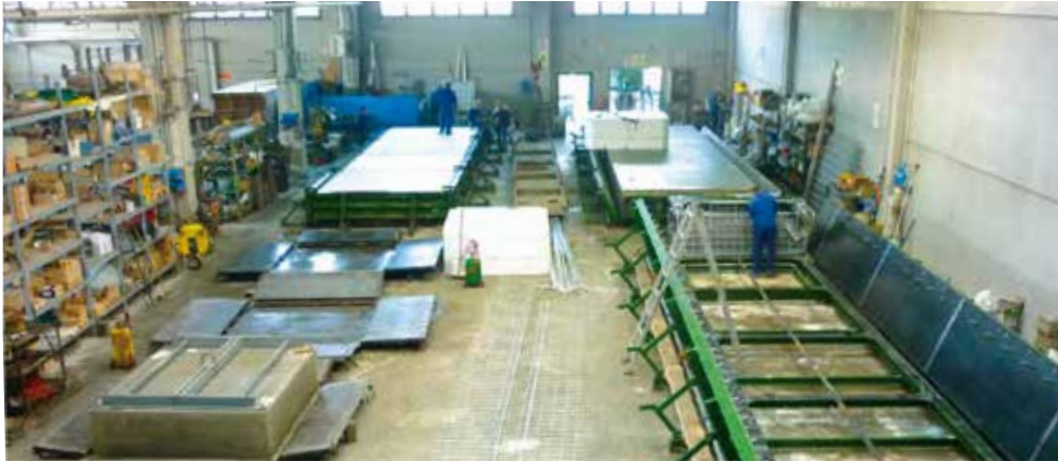
Concrete casting division