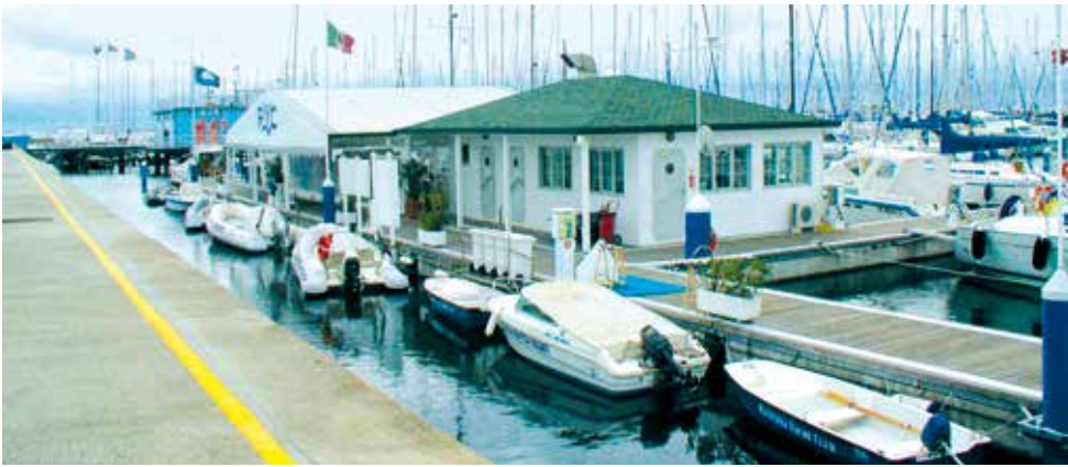
Floating club house, Ravenna Yacht Club, Ravenna - Italy