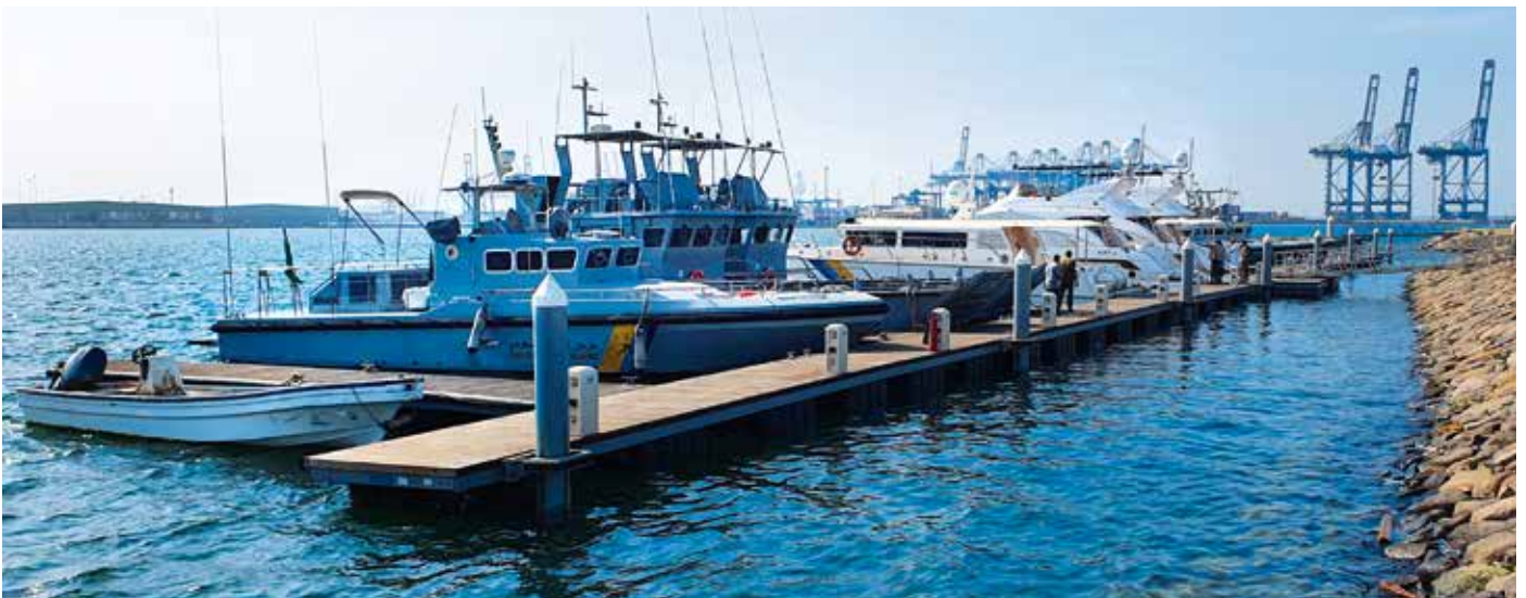
Landing platform for Coast Guard, Jeddah - Saudi Arabia