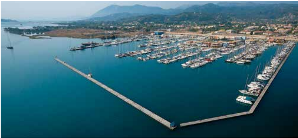
Lefkas Marina - Greece

The role of Ingemar is that of “highly qualified technical partner and reliable supplier” to: