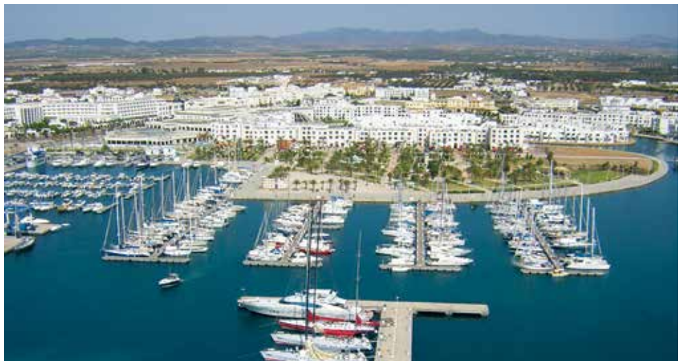
Marina Jasmine, Hammamet - Tunisia