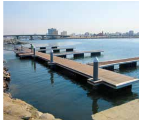
AL/PE type finger