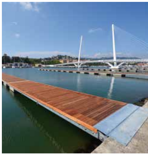
FE type discontinuous pontoon