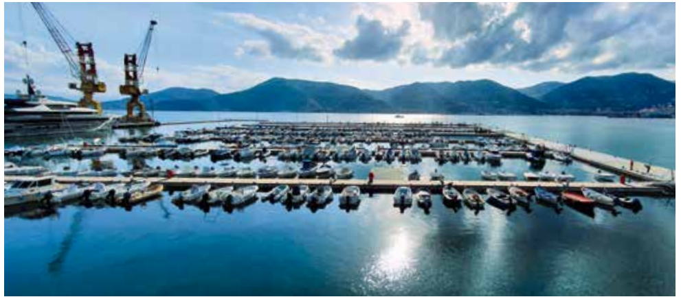
Marina Molo Pagliari, La Spezia - Italy