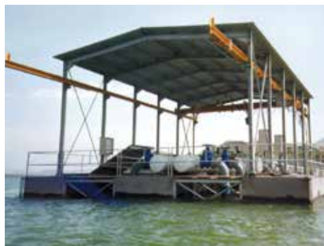
Floating pumping station, Lake Naro, Agrigento - Italy