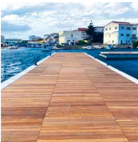
CA/LE type pontoon with granite side finish