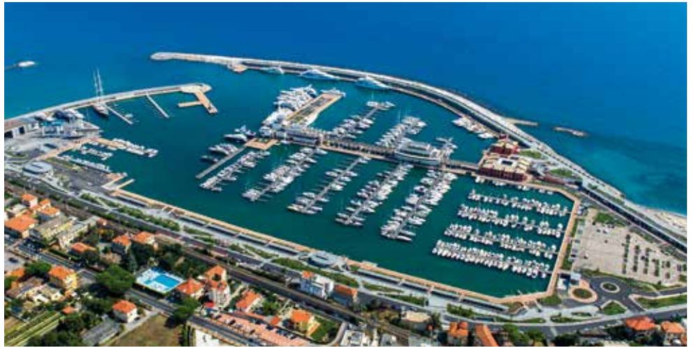
Porto Turistico di Loano, Savona - Italy

To overcome the difficulties and costs of transport, Ingemar established numerous licensing agreements for construction abroad, while for closer destinations it developed the technique of directly operating mobile construction sites. Ingemar is a leader in the sector in Italy and in the Mediterranean and it is present in several Middle Eastern countries.