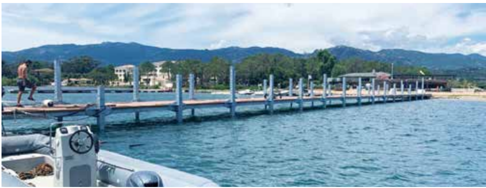
Prefabricated, fixed pontoon, seasonal, Porto Vecchio Marine, Porto Vecchio - France