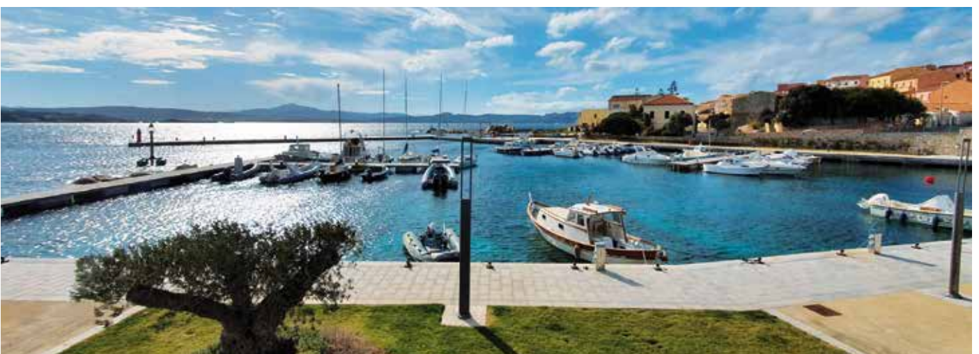
Marina Cala Balbiano, La Maddalena - Italy