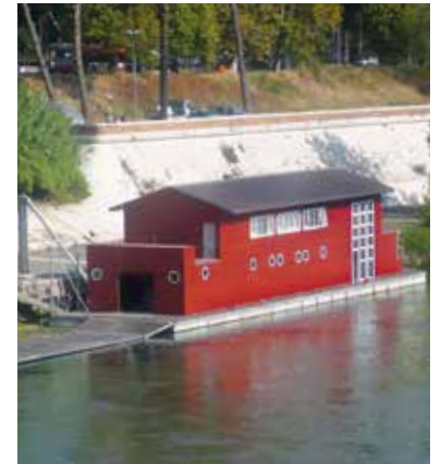
Floating nautic centre, I.U.S.M, Rome - Italy