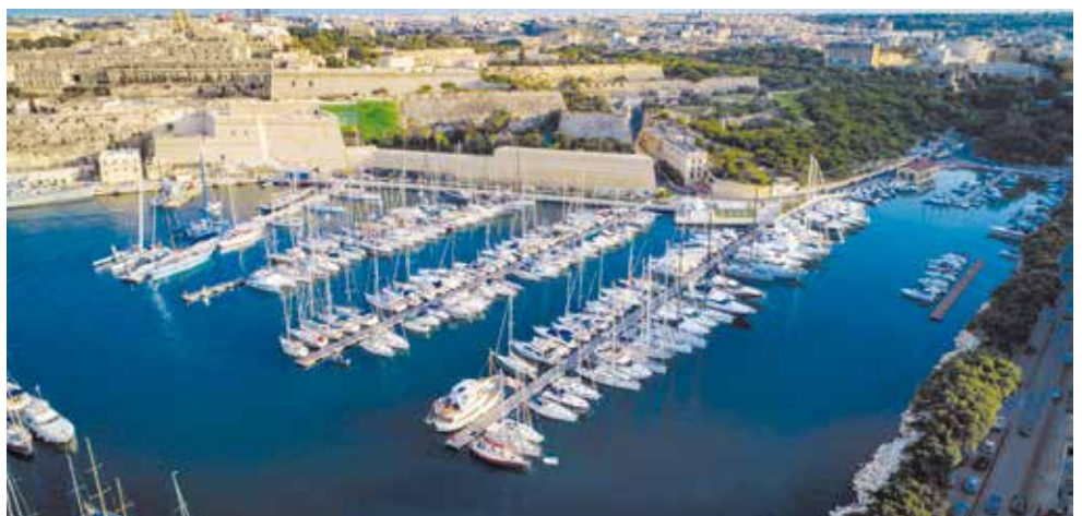
Marina Valletta - Malta