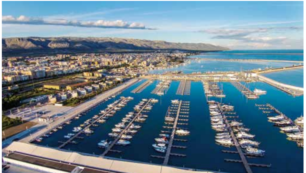
Marina del Gargano, Manfredonia - Italy