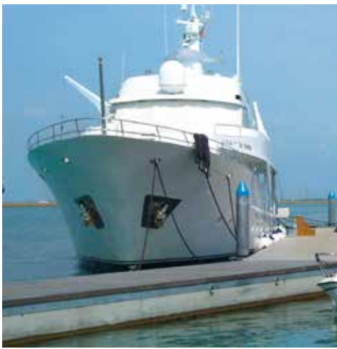
FE type continuous pontoon