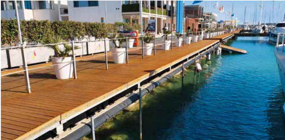
Prefabricated quay, Marina Cala dei Medici, Rosignano - Italy