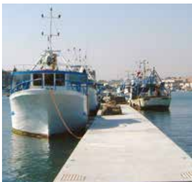
Pontoons for fishing boats, Taranto - Italy