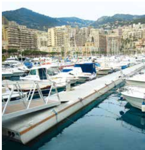
CA/CLS type pontoon with cast-in service ducts