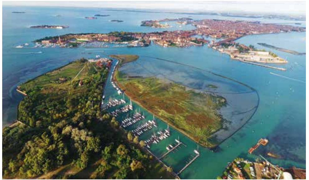
Marina Certosa, Marina Sant'Elena e Diporto Velico, Venezia - Italy

Usually, the types of fingers used are the same as the pontoons to which they are to be connected, therefore with steel or aluminium structures and concrete or polyethylene floats for installations with FE or AL pontoons. On CA/CLS pontoons, two alternative types of fingers are possible: discontinuous floating fingers as for the previous two types of pontoons with metal frames, or the adoption of monolithic reinforced concrete structures of the same characteristics as the pontoons. Production includes modules with length of 6.0, 7.5, 9.0, 10.5, 12.0 and 13.5m.