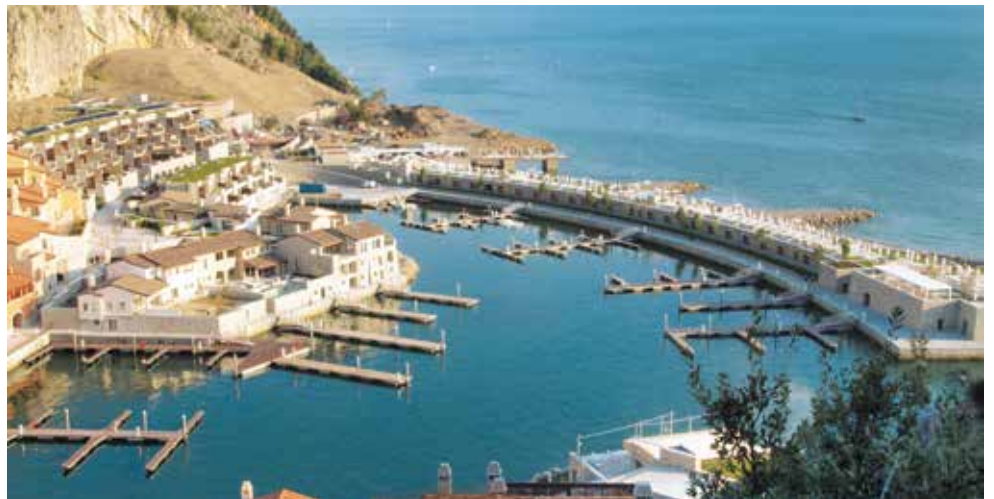
Porto Piccolo, Sistiana, Trieste - Italy