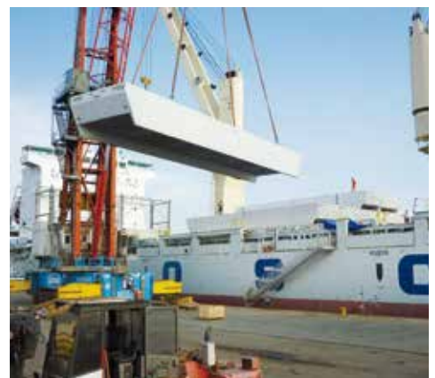
Loading for sea transport