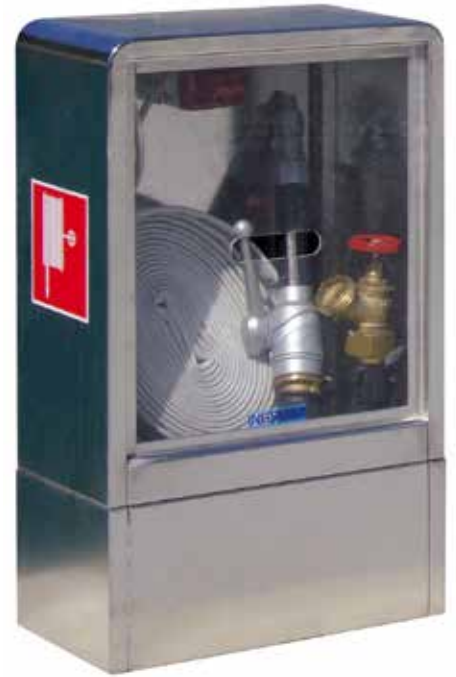
EROMAR 2 fire-fighting terminal