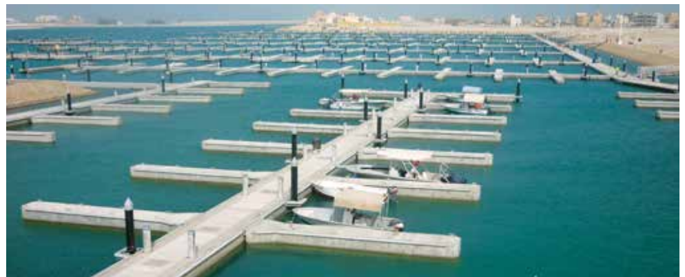
CA/CLS type finger