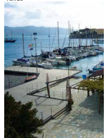
Fixed platform, Golfo dei Poeti, Porto Venere - Italy