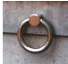
Stainless steel mooring ring