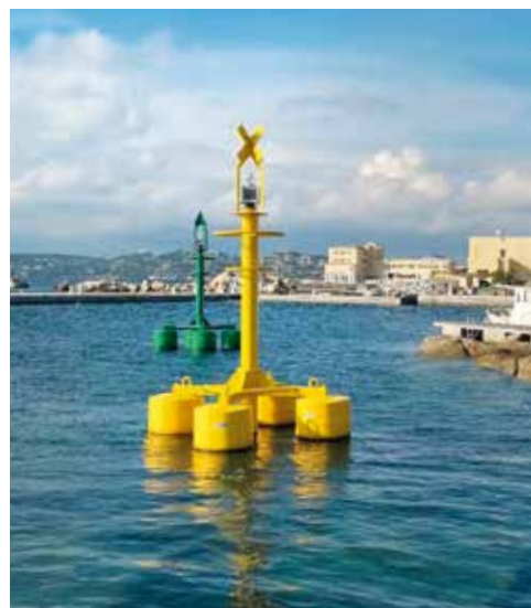
Marine beacon light