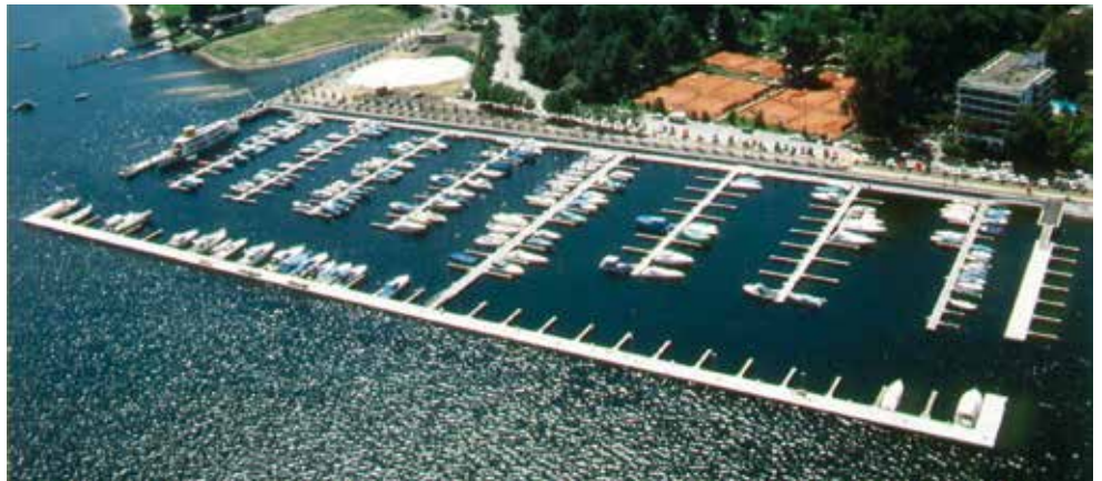
Porto Regionale di Locarno - Switzerland