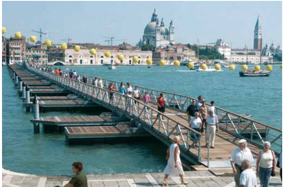
Ponte del Redentore, Canale della Giudecca, Venice - Italy

The installations are numerous and very diverse: floating buildings and floating crossings, landing stations for passenger boats and military vessels, platforms for sport and leisure as well as industrial structures are just a few examples of Ingemar's references in this exciting field of application of floating structures.