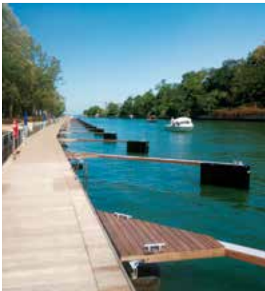
FE/PE type mini finger