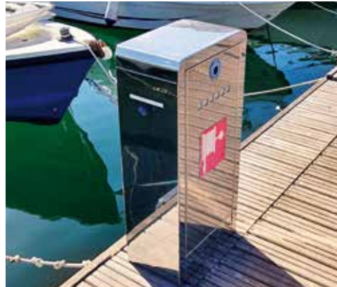
EROMAR 3 fire-fighting terminal