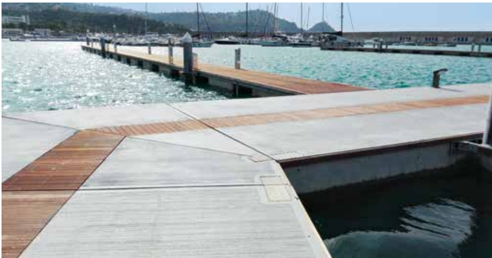
CA/CLS type floating pier with rigidly jointed elements, Capo d'Orlando, Messina - Italy