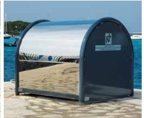
Sewage and oil disposal pump-out system