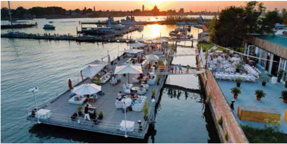
Floating platform, Certosa Island, Venice - Italy