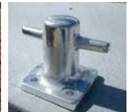
Aluminium bollard 10t