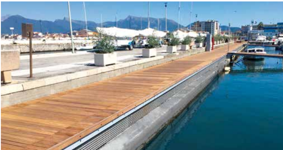
Renovation of a fixed quay, La Maddonnina, Viareggio - Italy