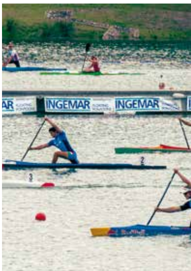
Canoe World Championship, Milano - Italy