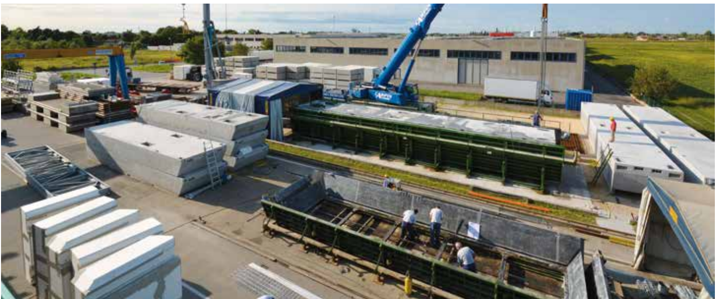
Outdoor area for construction, storage and loading of large CA/CLS products

Since 2003, all Ingemar group's activities have been concentrated in the new plant in Casale sul Sile, halfway between Treviso and Venice, while the company's registered office and top management functions remain in Milan, where it was founded in 1979.