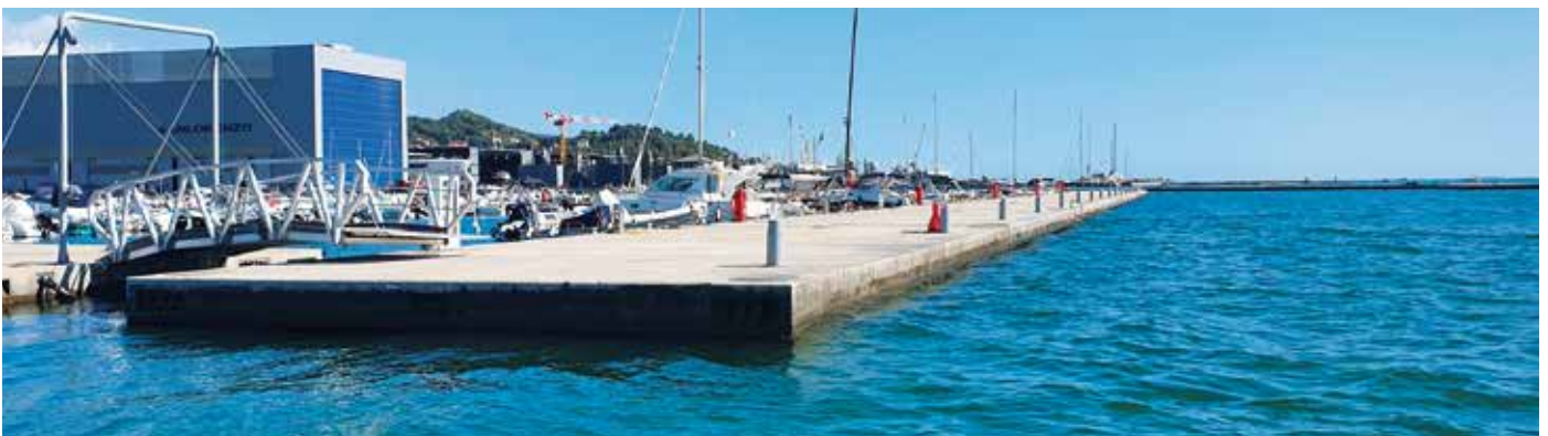
Floating breakwater FICA 20x10m, Marina Molo Pagliari, La Spezia - Italy

F/CA-type wave attenuators are the result of the experience gained by Ingemar over years of studies and applications in the field of breakwater systems. They consist of prefabricated monolithic reinforced concrete elements with a large expanded polystyrene core and characterised by very high displacement. When connected in series, these modules create floating barriers whose reliability, strength and durability are comparable to traditional fixed jetties.