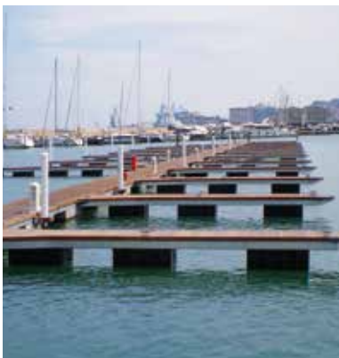
FE/PE type finger