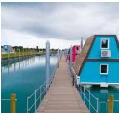
Marina Azzurra Resort, Lignano, Udine - Italy