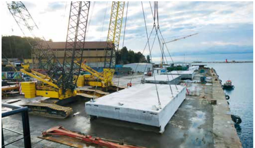
Mobile site for construction of breakwater elements 20x8m and 20x10m, La Spezia - Italy