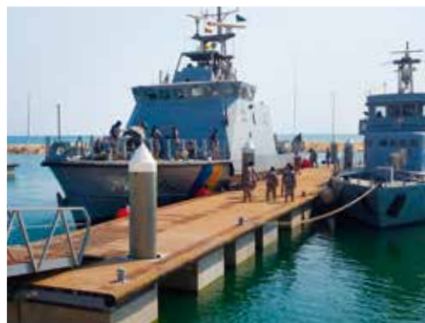
Piers for Coast Guard, Dammam - Saudi Arabia