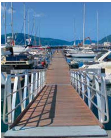
Porto Montenegro, Tivat - Montenegro