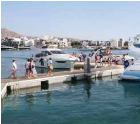
AL type discontinuous pontoon