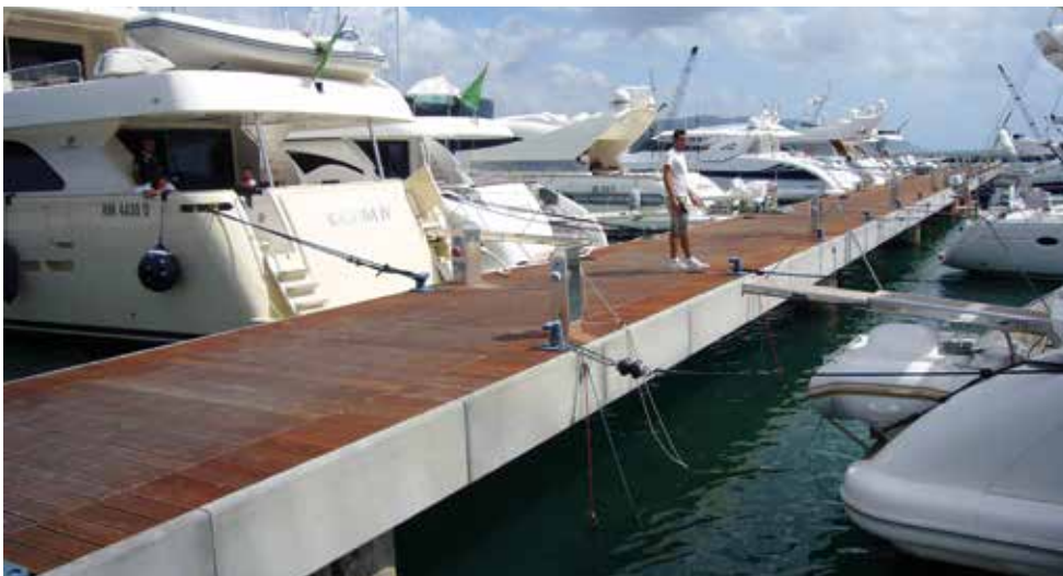
Fixed pontoon for boat mooring, Porto Mirabello, La Spezia - Italy