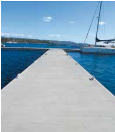
Porto Vecchio Marine, Sant'Amanza - France