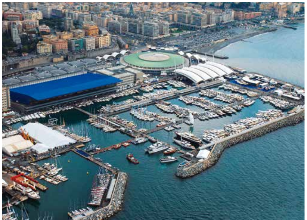
International Boat Show, Genoa 2011, Genoa - Italy

Over the years, Ingemar's technical capabilities and production diversification enabled the company to successfully tackle the specific issues of events on the water and boat shows. Customised designs and rapid intervention have been the winning points of the innovative solutions to very special requirements, as in the case of the floating pavilion for the Biennale of Architecture in Venice, the floating stage in Viareggio and the floating platforms for the Navigli festival in Milan. The flexibility and versatility of Ingemar's standard modules, on the other hand, proved to be successful in the case of sporting events such as the Vele d'Epoca trophy in Imperia, the Italian events of the Louis Vuitton Cup in Naples and Venice, the Offshore Powerboat World Championship in Chioggia, the maritime festival in La Spezia and the Riva shipyards' vintage boat rallies in Sarnico and Venice. Ingemar's greatest success, however, is its presence at the most important Italian boat shows. Since 2005, the Genoa International Boat Show has been a true showcase for Ingemar, participating as technical partner of the exhibition with the supply of approx 10,000 square metres for the furnishing of the floating exhibition area. The collaboration with the Venice International Boat Show began in 2006 and over the last 3 years has seen Ingemar's piers and floating platforms hosting boats and events in the stunning setting of the Serenissima's historic Arsenal.