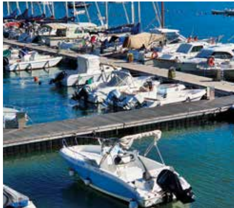
FE/PE discontinuous pontoon