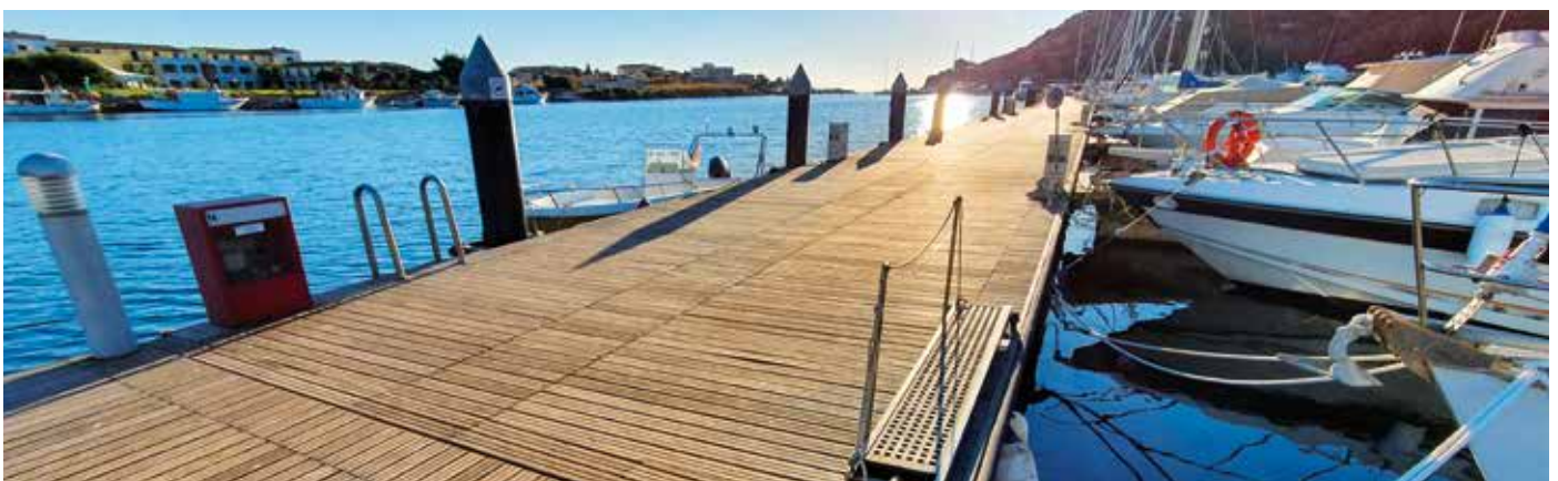
Floating pier FE/CA, Bosa, Alghero - Italy