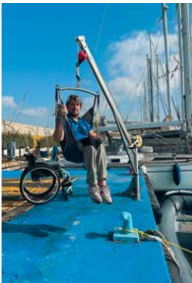
Transfer crane CRANE4A