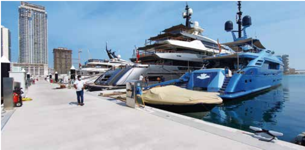
CA/CLS type monolithic floating pier, Dubai Harbour Marina - UAE