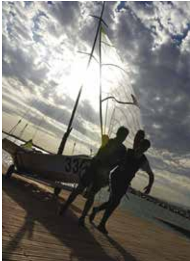
Athens Olympic Games 2004 - Greece