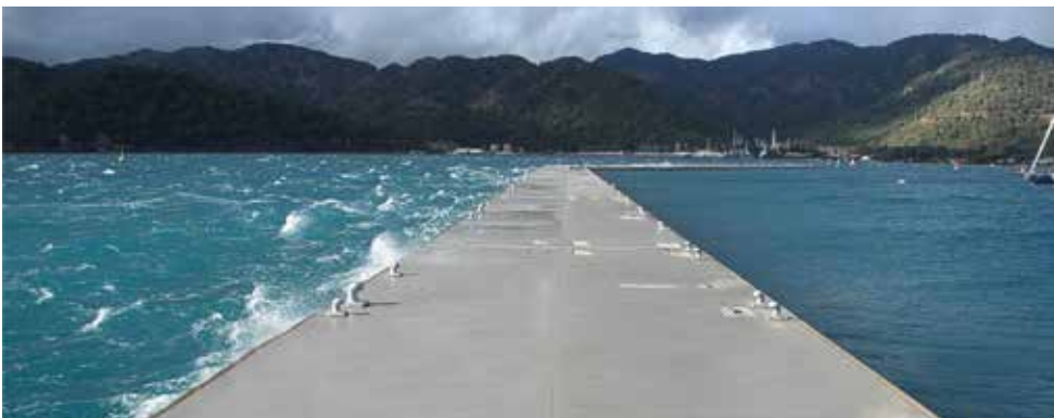
Floating breakwater FICA 20x6m, D-Marin Marina, Gocek - Turkey