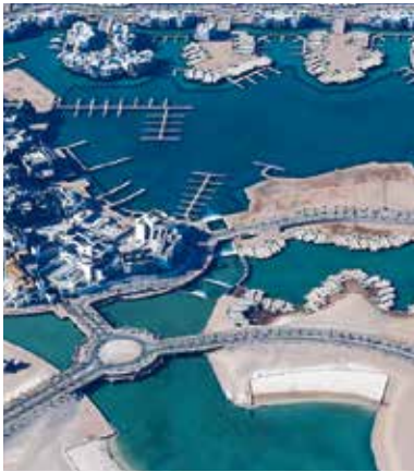
Ayla Marina, Aqaba - Giordania