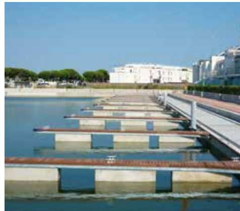
FE/CA type finger