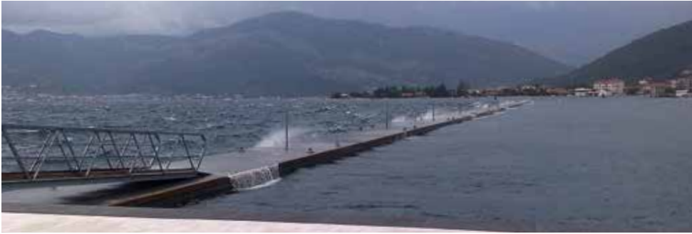
Floating breakwater FICA 20x4m, Porto Montenegro, Tivat - Montenegro