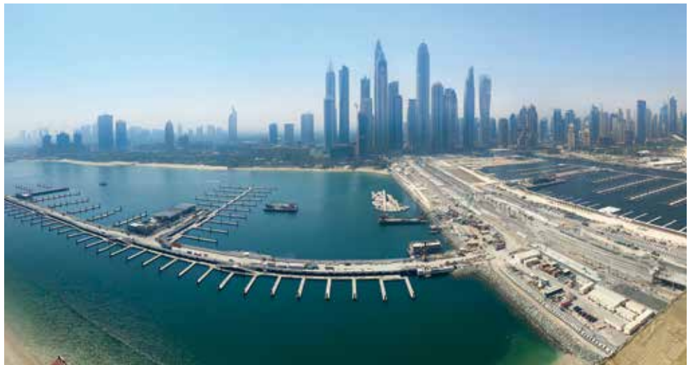
Dubai Harbour - United Arab Emirates