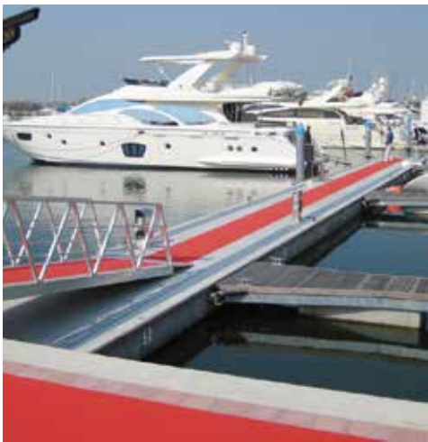
CA/CLS type pontoon with embedded service side channel