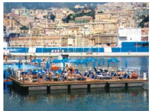
Floating bathing platform, Porto Antico, Genova - Italy