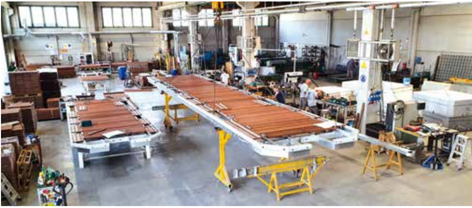
Deck assembly division