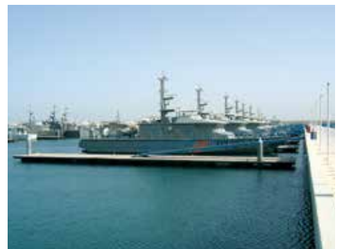
Coast Guard pontoons, Al Fintas - Kuwait