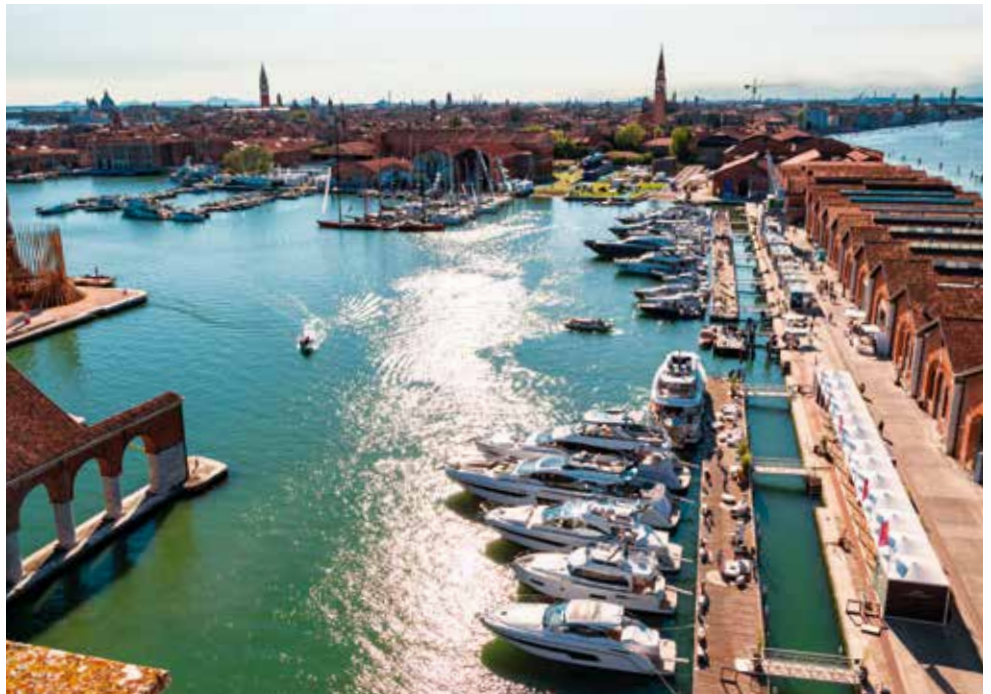
Venice Boat Show 2022, Venice - Italy