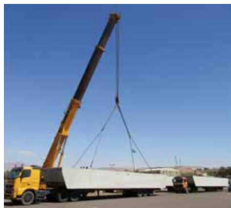
Road transport of wave attenuator elements