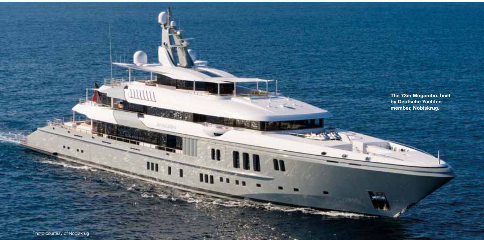
The 73m Mogambo, built by Deutsche Yachten member, Nobiskrug.