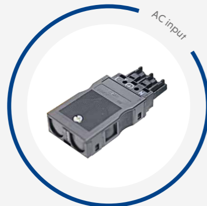
Plug & Play